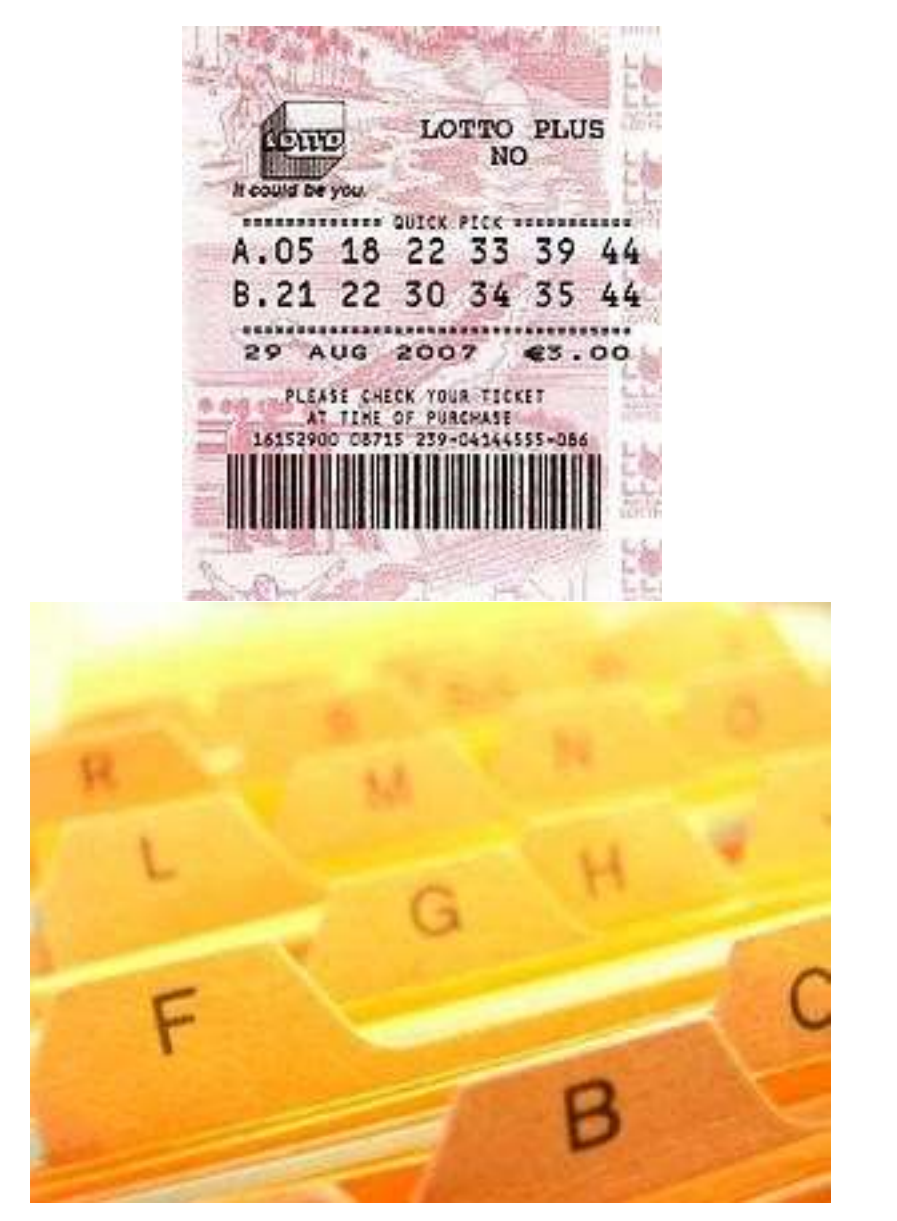
The BEST strategy for winning the Pick 6 Lottery nightly!

With that in mind, you are ready to move forward with our Pick 6 Strategy for winning jackpot games like a pro!